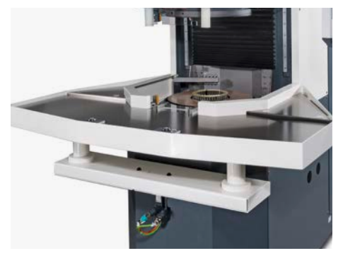
AC 400-F gap loading table for comfortable machine operation